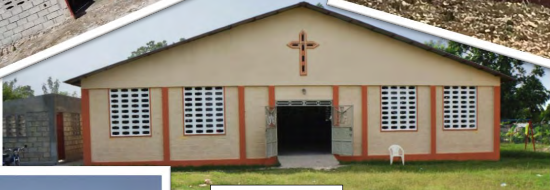
CrossRoads Church Ponce