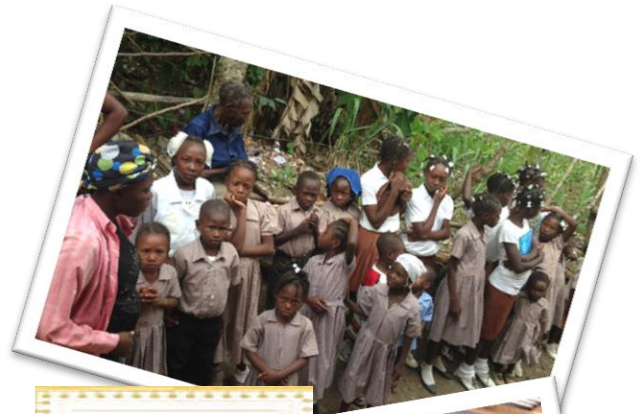
Waiting in Line