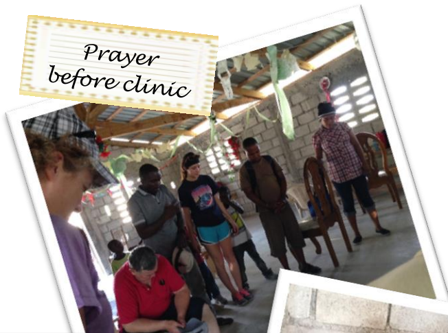
Prayer before clinic

As they say, a picture is worth a thousand words, and I think the images on the next few pages will give you a sense of how God used this team to minister to His people in Haiti.