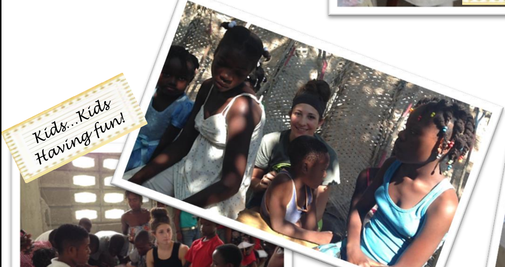
Kids...Kids Having fun!