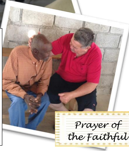
Prayer of the Faithful