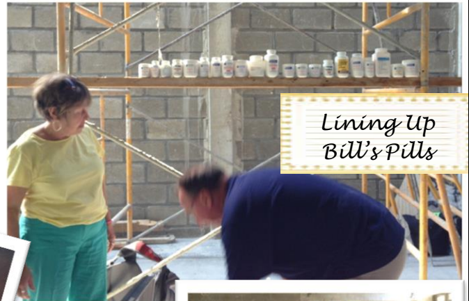
Lining Up Bill's Pills