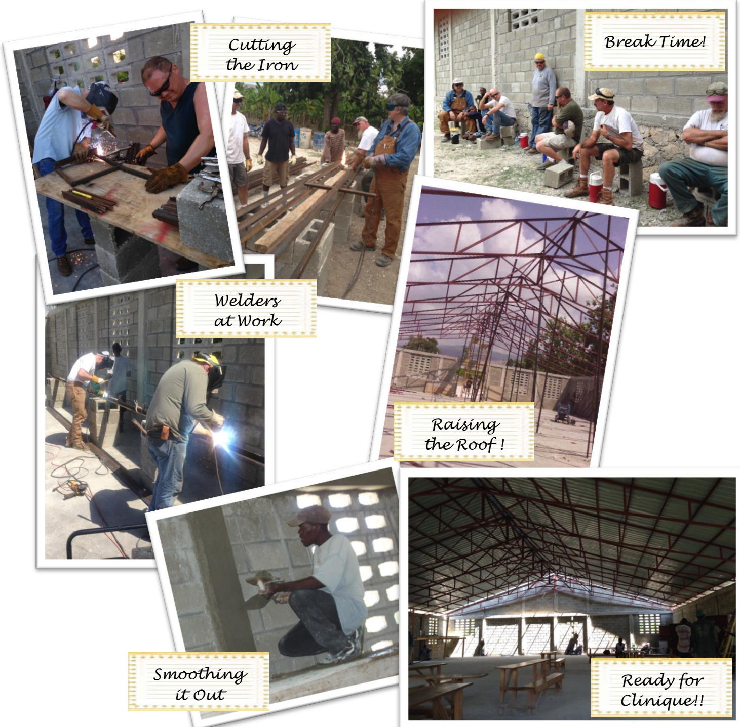
Cutting the Iron

All of the teams from the States did a great job of quickly getting the building under roof and workers are now finishing the inside. The remaining work, including painting both inside and outside, will be completed by local Haitians. Below are pictures from the March trip.