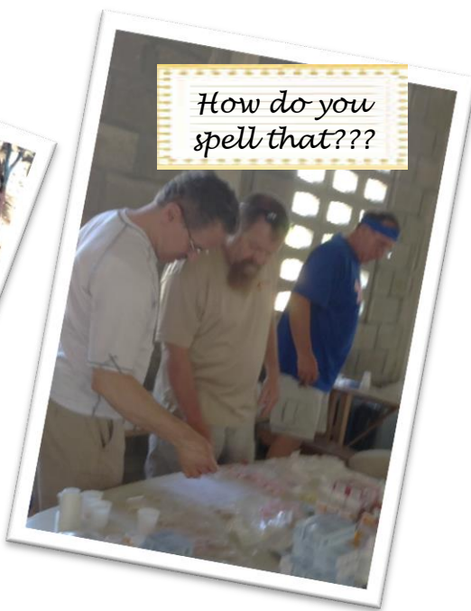
How do you spell that???