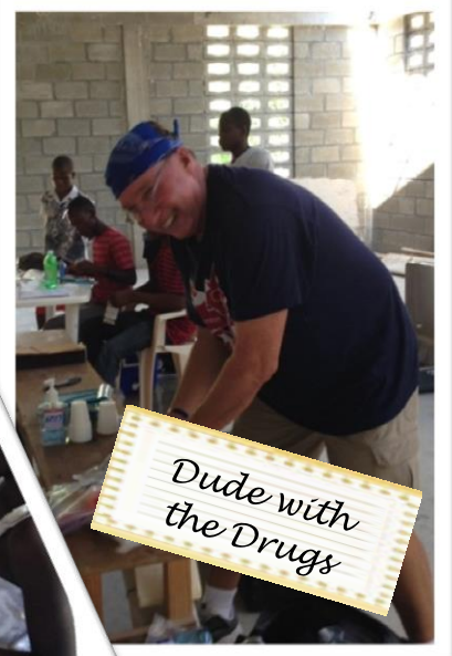
Dude with the Drugs

I was on the second work team and the feeling I had when I saw the building this trip was indescribable. I could only think of how much of a blessing it is going to be to the community and I know that God has great plans for the new Church.